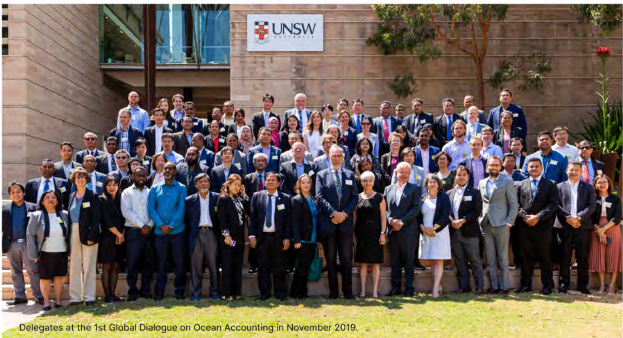
Delegates at the 1st Global Dialogue on Ocean Accounting in November 2019.

Link to register for training: https://unsw.au1.qualtrics.com/jfe/form/SV_3n2cVd6qsSVNbZs?ref=oceanaccounts.org